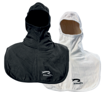
Particulate Blocking Hoods

CS@RICOCHET-GEAR.COM | 215-849-1971 | RICOCHET-GEAR.COM