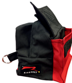
SCBA Mask Bag