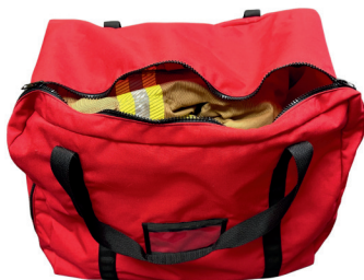
Firefighter Gear Bag